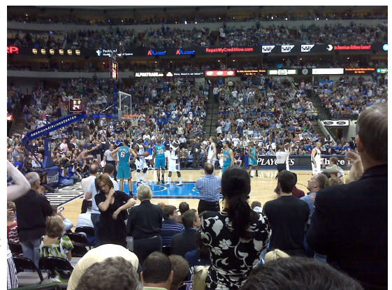
METROCREST SUMMER LEAGUE ACTION