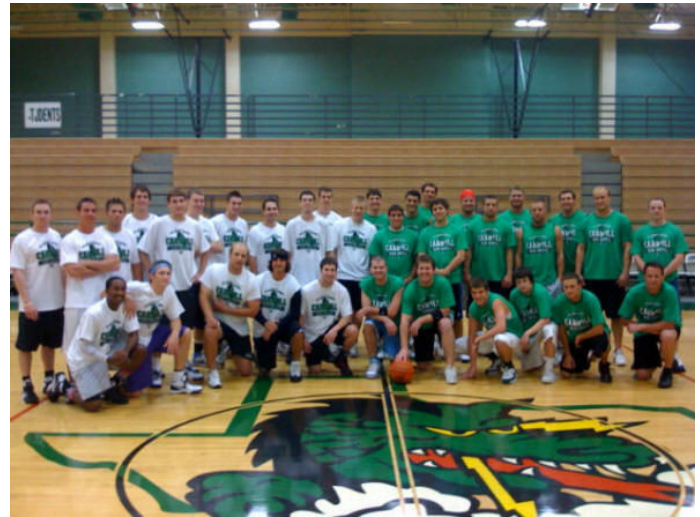
2009 Alumni Game Odds 124, Evens 117