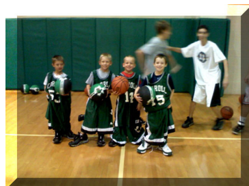
2008 Little Campers